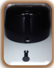
Register Assembly Seal Pin

**Please note Register Assembly Seal Pin will be removed for competition.